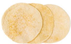
Pita Bread 20 cm 8.000 Pita Bread 25 cm 10.000