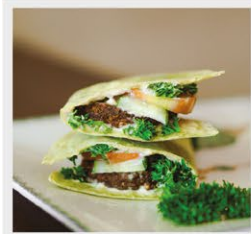
Falavel Sandwich Vegan green torila stuffed w crispy falafel balls, veggies, & nutty hummus sauce 45,000