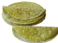
Tortilla Green 20cm 7.000