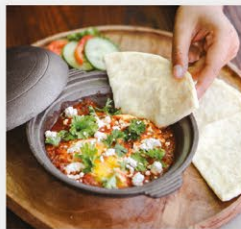
Shakshuka poached eggs in spiced tomato & pepper sauce topped w feta cheese & fresh cilantro 55,000