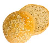
Mini Burger Bun 80 gr 7.000 Burger Bun 150 gr 10.000