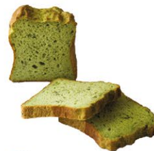
Green Bread 50.000