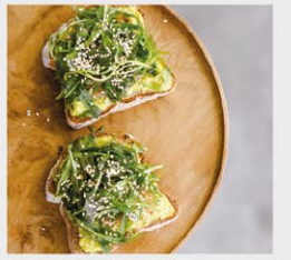
Avo On Toast with Salmon sourdough topped w mashed avo, arugula, & smoked salmon 75,000