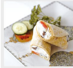
Falavel Sandwich pita bread stuffed w crispy balls, veggies, & nutty hummus sauce 48,000