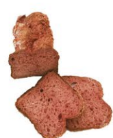
Beetroot Sourdough 50.000

Prices Are Represented In Thousand Of Rupiah (.000). Subject To Prevailing Government Tax (10%) & Service Charge (5%)