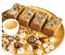
Dates Bread 20.000 Dates Bread Loaf 120.000