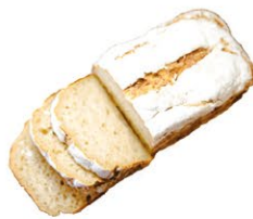
Sour Dough 45.000