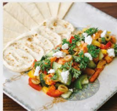
Hummus and Greek Salad hummus w cucumber, tomatoes, bell peppers, olives & feta cheese, served in pita bread 65,000