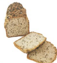
Multigrain Bread 50.000