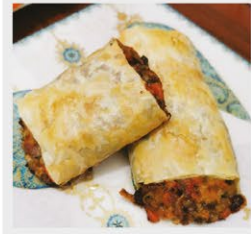
Beef Roll minced beef w veggies & cheese, rolled in gluten-free pastry 45,000