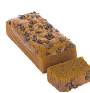
Pumpkin Bread 20.000 Pumpkin Bread Loaf 120.000